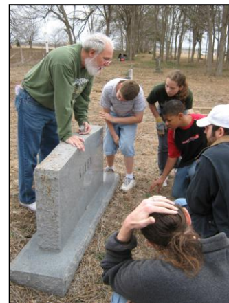
Texas Historical Commission RIP Guardian Program protects historic cemeteries