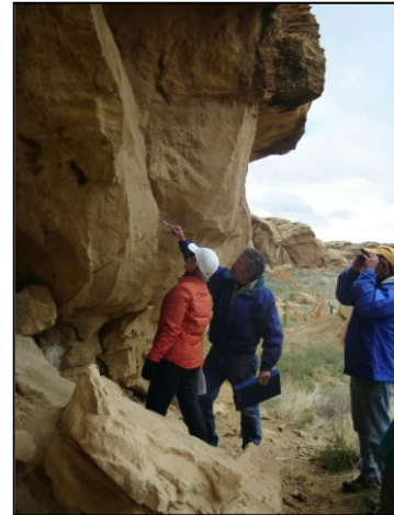
New Mexico SiteWatch volunteers record archaeological remains