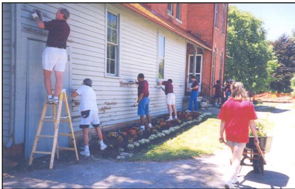
Volunteers work to preserve the Oberlin Heritage Center